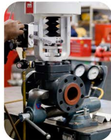
Control Valve Repair & Diagnostic Testing