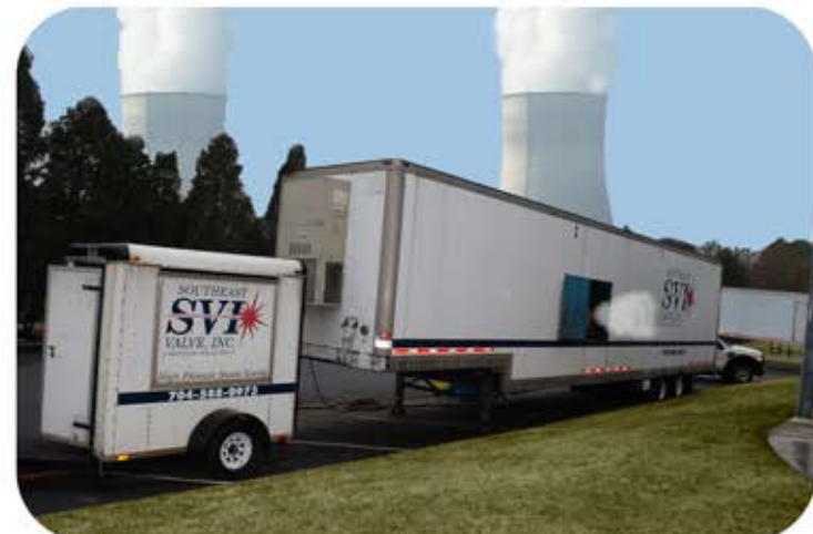
Mobile Steam Testing Unit For Safety Valves ASME / NBIC Code Required