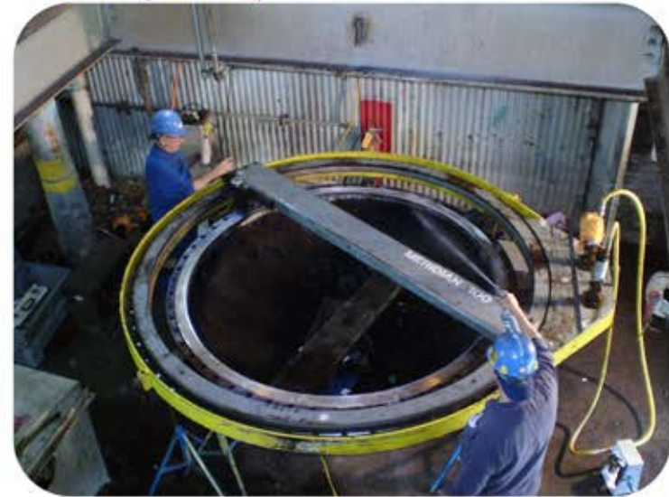
Flange Facing of 84" Digester Head